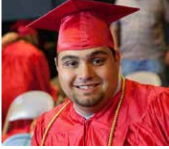
Lifelong learning for all!

Non-Profit Organization U.S. Postage PAID Permit No. 90 Santa Clara, CA