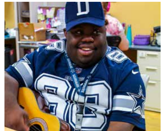
Trying out Adaptive Guitar

CAA continues to grow and flourish thanks to the collective goodwill, spirit, and belief that education truly is for all adults who want to continue to grow and learn and to become the best versions of themselves. Thank you for your steadfast belief in this model. Please join us at Saratoga Springs on 10/10 for a #CAA10YearsStrong Epic Party of the decade!