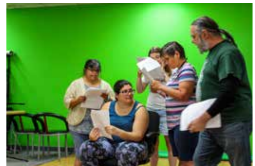
Acting students review their scripts