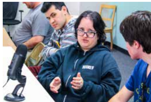
Rehearsing interview techniques