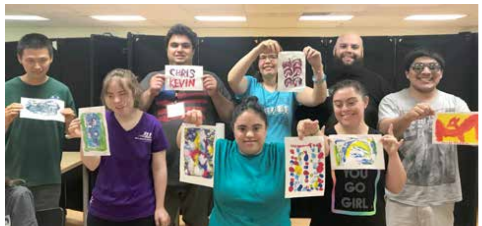
CAA student artists showing off their work