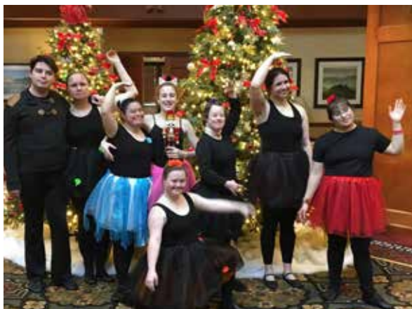
CAA's graduate ballet dancers at a Nutcracker workshop with Los Gatos Ballet