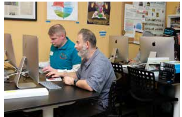
CAA's new Digital Media Lab features four workstations thanks to Rotary Club of SJ Foundation