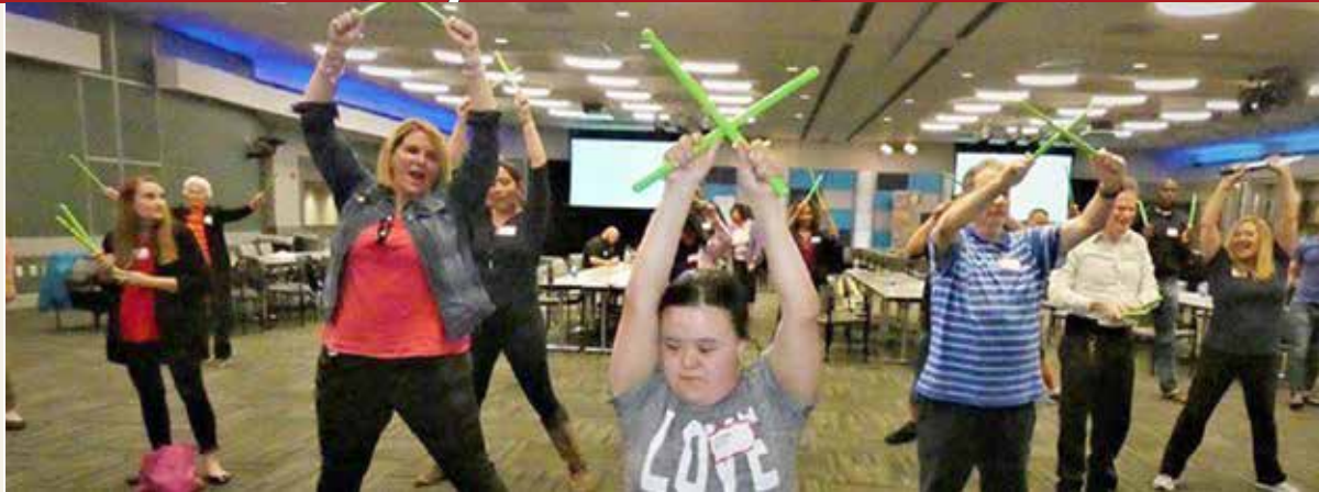
Cisco employees and CAA students making connections