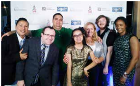
The award-nominated CAA-TV crew at CreaTV San Jose's Creatives Awards Ceremony