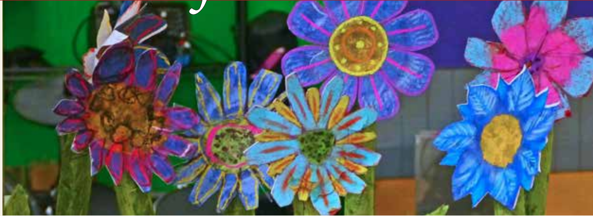
3D Art: Tactile and Textural Study