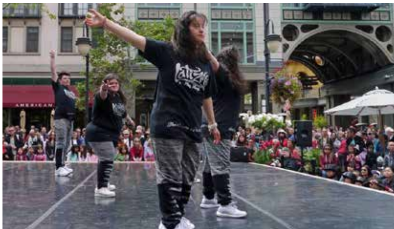
Latizmo community performance