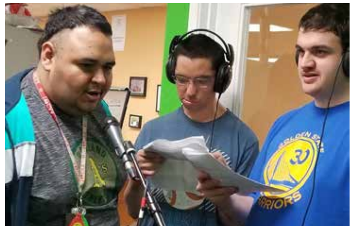
Working on voiceovers